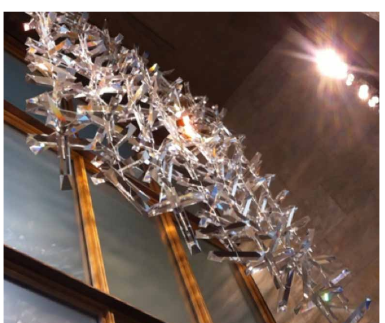
Contact a product manager for more information.