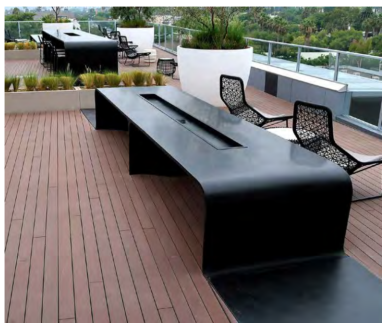
Contact a product manager for more information.

MATERIALS: Tactile Polished GFRC<sup>™</sup> PRODUCTS: Tactile Public Furnishings<sup>™</sup>