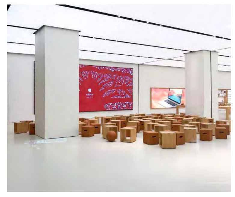
Contact a product manager for more information.

MATERIALS: Tactile Polished GFRC Cladding™