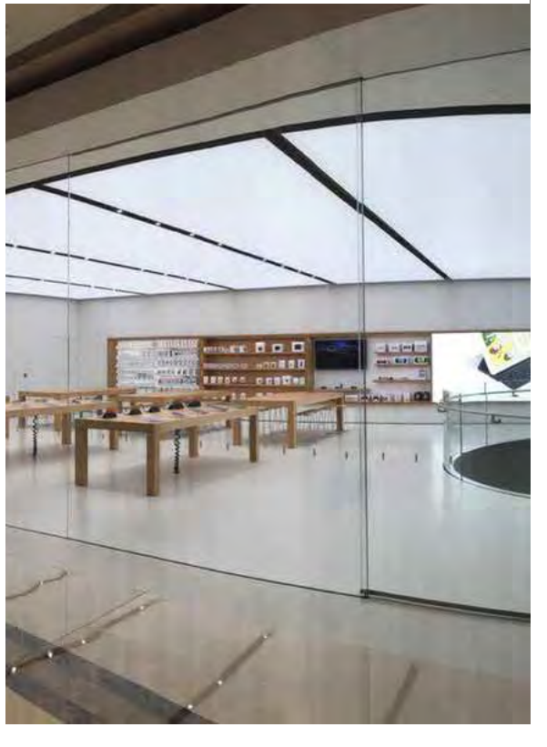
Contact a product manager for more information.