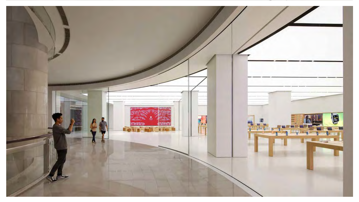
Contact a product manager for more information.