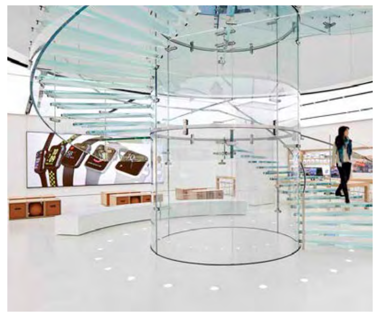
Contact a product manager for more information.

MATERIALS: Tactile Polished GFRC Cladding™