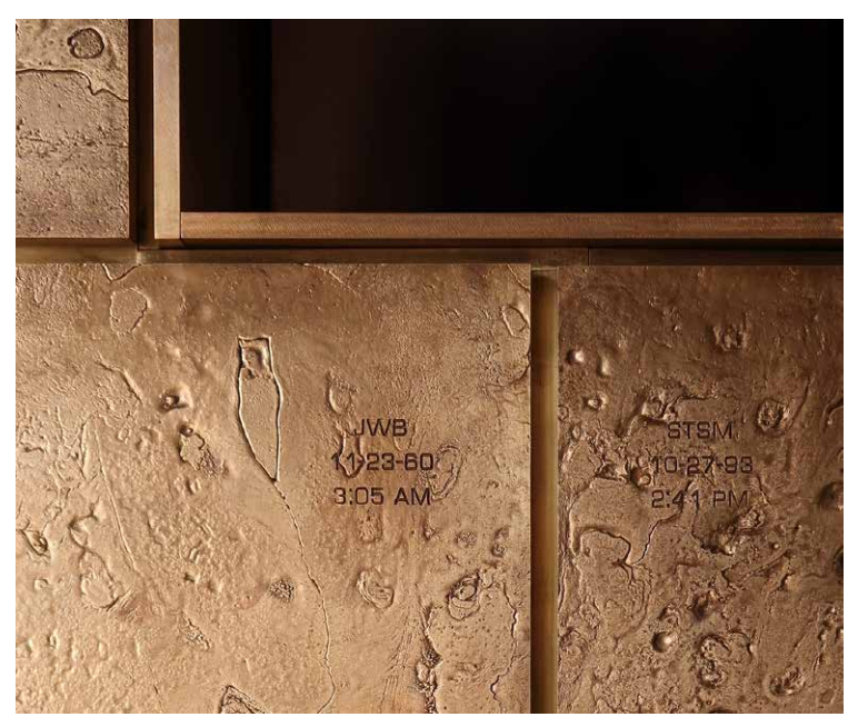
Contact a product manager for more information.